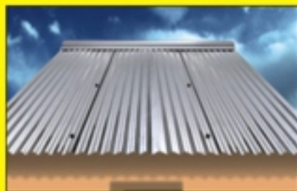
Tata Shaktee GC Sheet with 15 corrugations